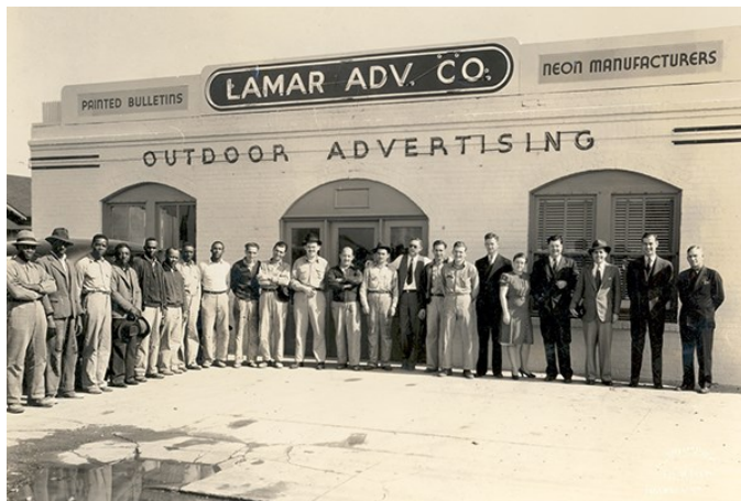
Lamar Advertising has been in business since 1902.